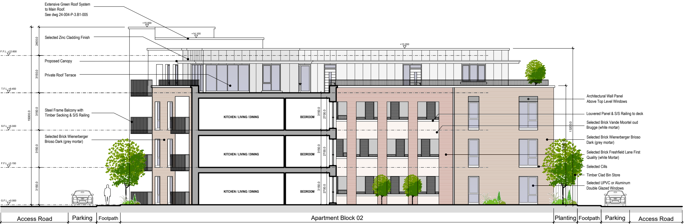
Apartment Block 02 - South West Sectional Elevation Scale 1:200